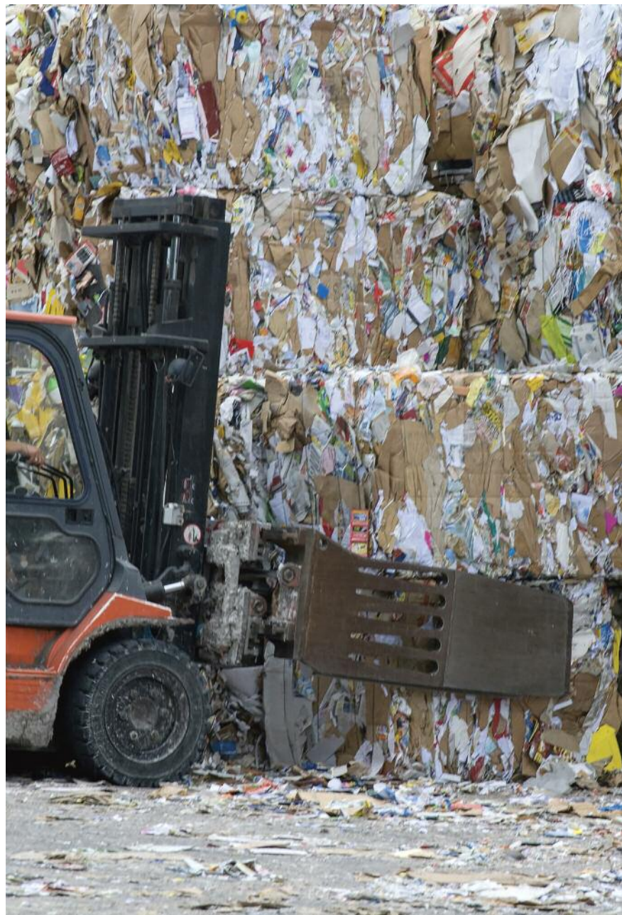
Forklift operator moving bales of paper