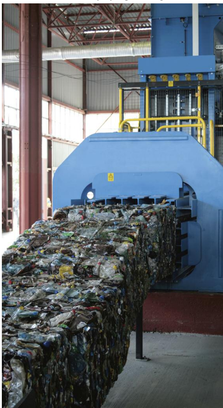
Bales of recycling exit a compactor

erate, maintain, or work adjacent to moving machinery such as compactors, conveyer belts, and sorting machinery. These rules and protocols require that machinery be de-energized (and not able to be turned on) while a worker is cleaning, servicing, or adjusting the machinery. Workers need training and sufficient time to complete tasks in order to comply with these protocols.