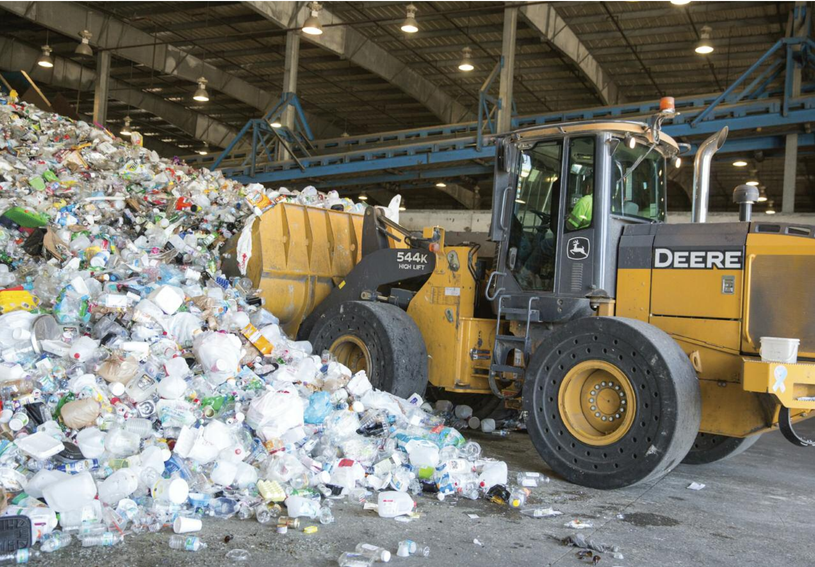
Bulldozer moving collected recyclables